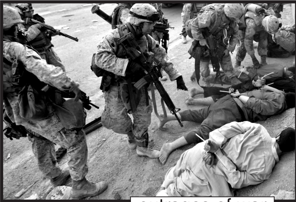
U.S. troops carrying out mass roundup, Fallujah, Iraq, 2004