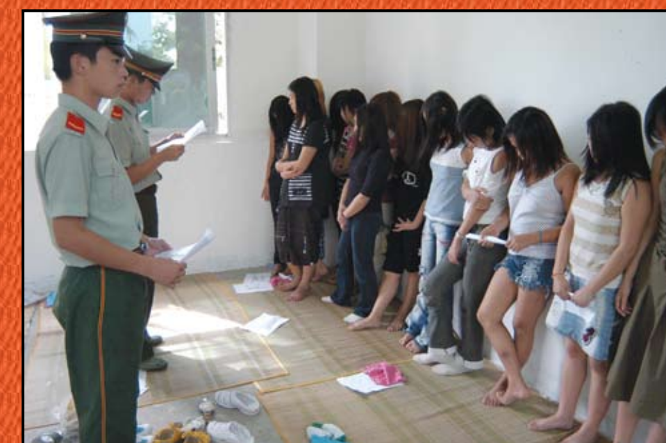
Chinese girls, promised a better life, are caught being smuggled to Taiwan where most would end up in prostitution.