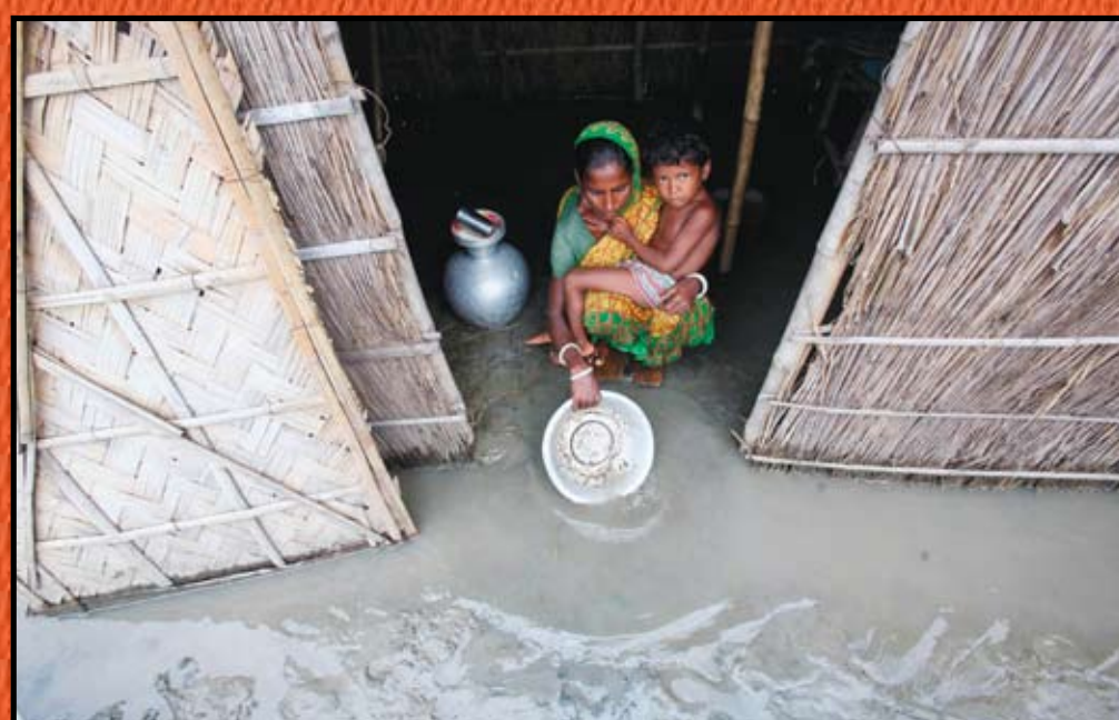
A woman sits with her daughter in her flooded house at Jafragonj, north of Dhaka, Bangladesh, September 2008.

The unplanned and profit-in-command nature of capitalism-imperialism has led to ecological and environmental disasters with potentially catastrophic consequences for all of humanity. The U.S., with 4.5% of the world's population, is responsible for over 30% of global warming—which is caused by greenhouse gases from burning of fossil fuels and other sources. Rising global temperatures are melting large areas of polar ice caps. This may cause massive flooding of low-lying areas, like the country of Bangladesh. The melting of the Himalayan glaciers is threatening the source of more than half of the drinking water for over 40% of the world's population. Some lakes in Africa have become sand dunes, leading to the collapse of fisheries, crop failures, and starvation.