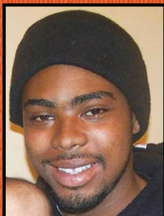
Oscar Grant was murdered by Oakland police.