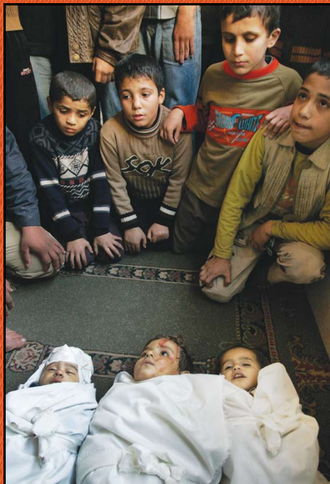
Thirty members of the al Samouni family were slaughtered by Israeli shells, January 4, 2009. They were in a house where they were told to seek refuge. Above, children mourn three of the youngest who were killed.