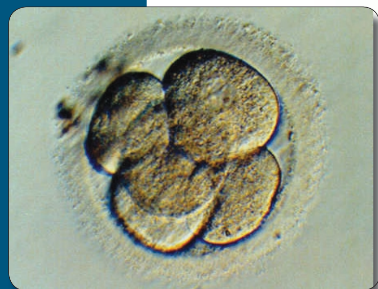
Several-day-embryo clump of cells

Well then, isn't an abortion killing another human being? No, absolutely not.