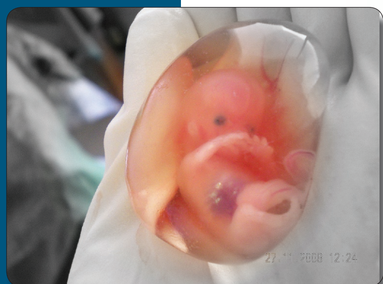
Above: Ten-week fetus

2 The anti-abortionists carry big signs showing fetuses floating around in a woman's uterus, as if they are totally separate from women. But contrary to how they portray things, an embryo or fetus can't survive on its own. It gets oxygen from a woman's blood, excretes waste through the woman ... And this is true until the fetus is born and becomes a baby. It is no more an independent human being than any other organ or part of a woman's body.