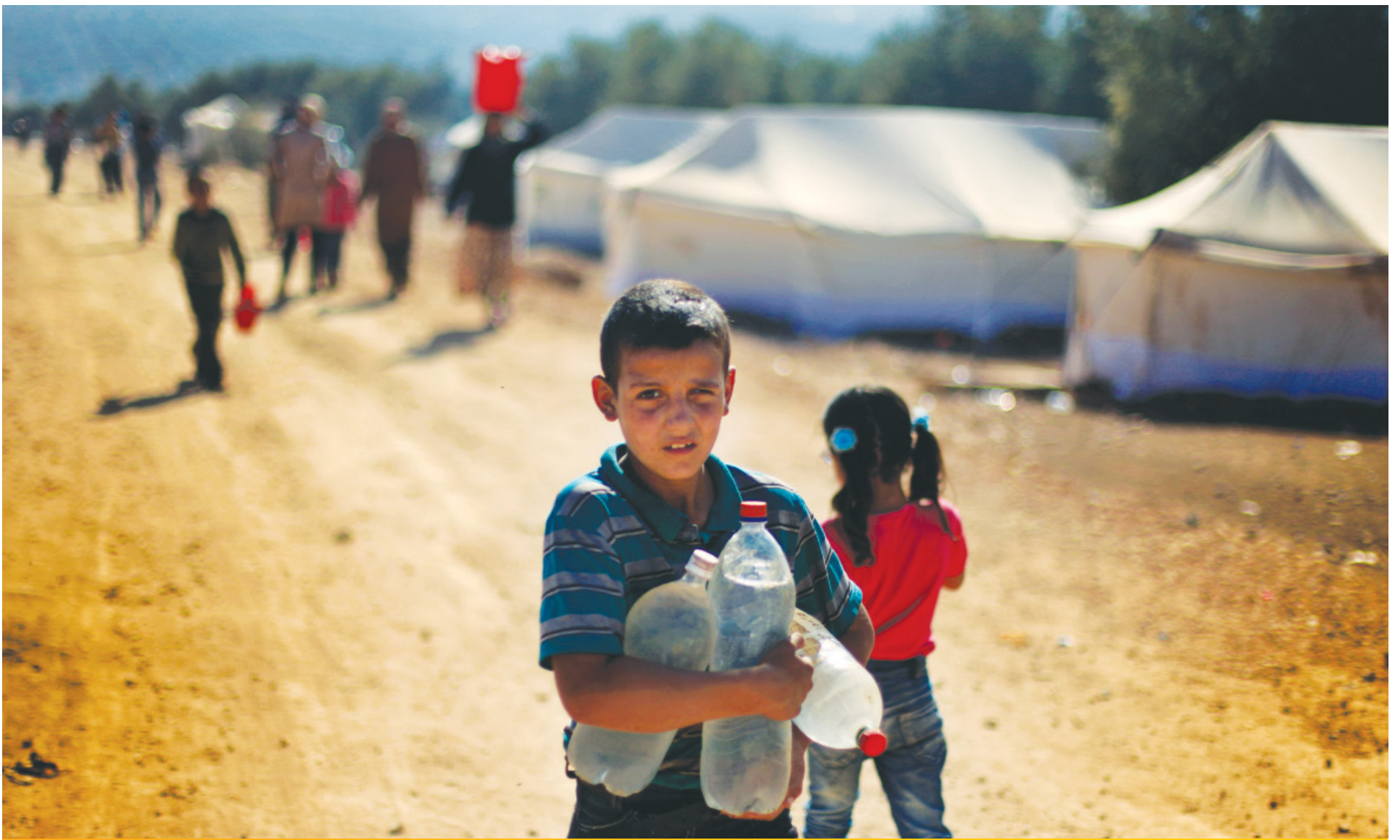
Since 2011, about four million Syrians have been displaced within the country, according to the United Nations. To escape the violence, as many as 1.5 million have fled to neighboring countries. A half-million alone are in camps in Jordan and more than half of all Syrian refugees are children. Above, a Syrian boy with his family in a refugee camp near the Syrian-Turkish border, November 2012.

No more generations of our youth, here and all around the world, whose life is over, whose fate has been sealed, who have been condemned to an early death or a life of misery and brutality, whom the system has destined for oppression and oblivion even before they are born. I say no more of that.