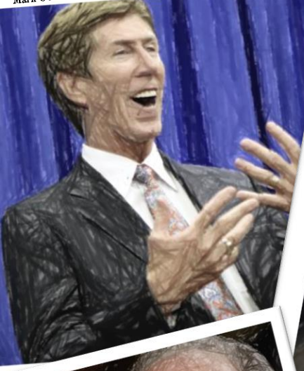
Mark O'Mara, George Zimmerman's Defense Attorney