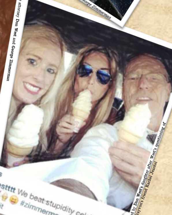
59 likes mollywestttt We beat stupidity celebration cones 🍦🍦🍦 #dadkilledit #zimmerman #defense