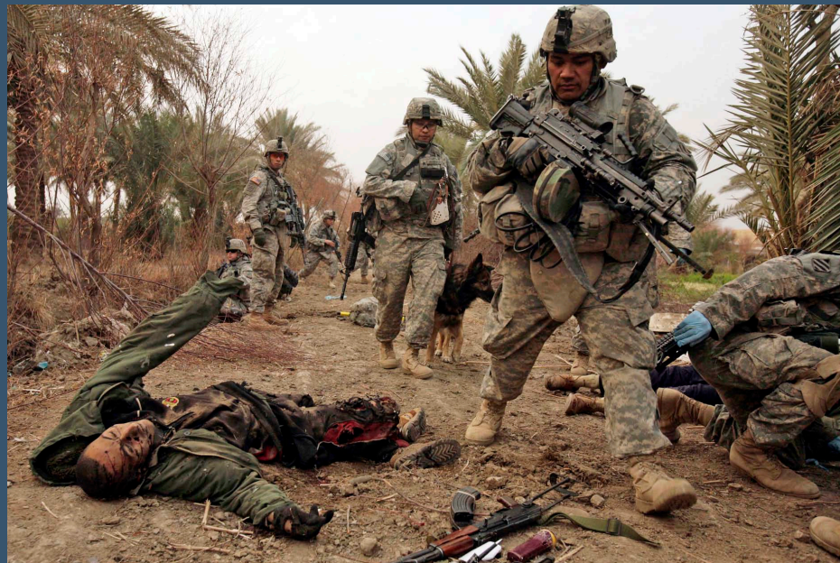
2008, U.S. troops pass the body of a person killed by an attack helicopter in Arab Jabour south of Baghdad, Iraq.