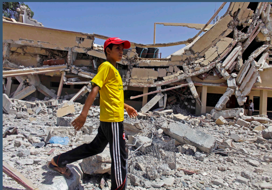
2011, a university building in Zlitan, Libya was destroyed by NATO airstrikes.