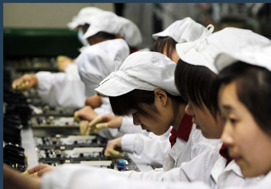
2010, workers make iPhones and iPads at the Foxconn complex in Shenzhen, China.