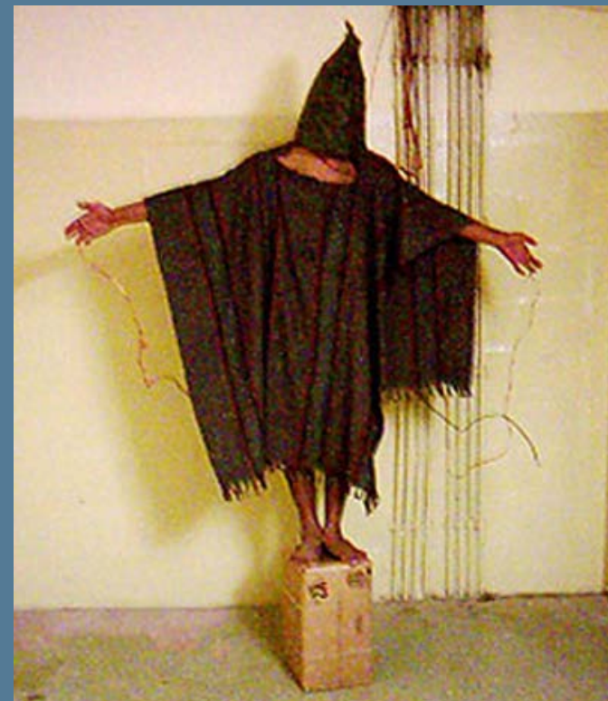
2003, the CIA and U.S. troops in Iraq torture prisoners at Abu Ghraib.