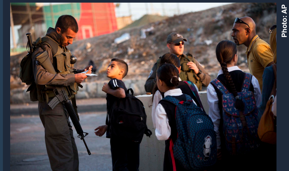
2015, Israeli border police check Palestinian children's identification at a checkpoint in Jerusalem.