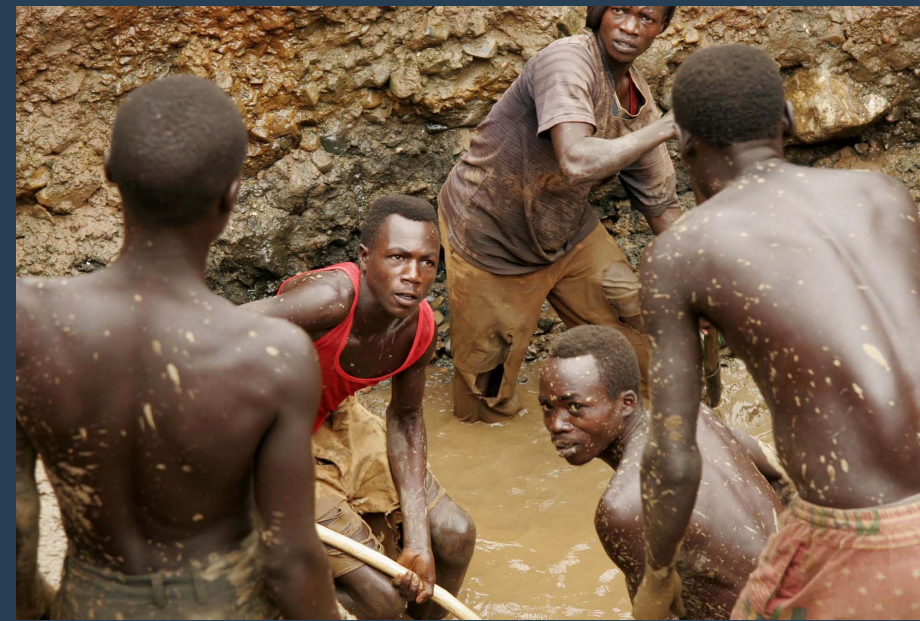
2006, gold miners at Ika Barrier, Democratic Republic of Congo.