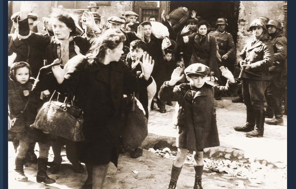
1943, German troops round up Jews after the uprising in the ghettos of Warsaw, Poland.