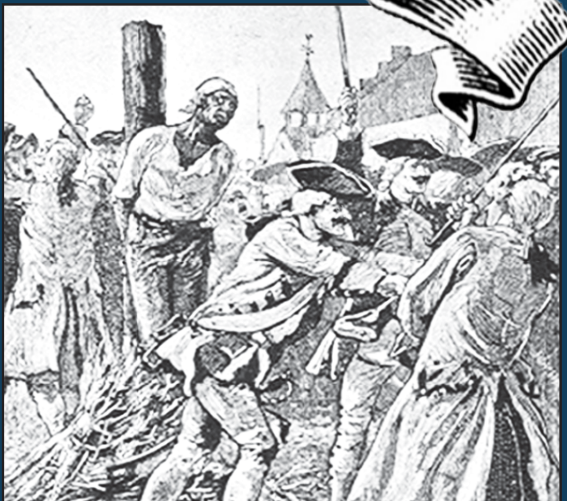
The brutal repression of a slave rebellion in New York, 1741.

Basics 1:1 from the talks and writings of Bob Avakian