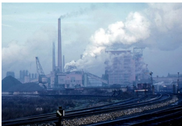
Trump's EPA is rolling back enforcement of environmental protection laws, giving industry free rein to pollute. Here a belching coal plant.

4. Gutting environmental regulations, accelerating capitalism's plunder of the earth.