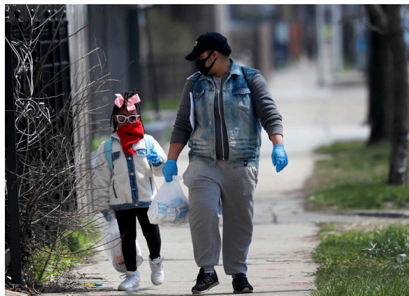
A woman and her child walk home after getting lunch at a South Side Chicago school, April 7.

7. Covering up the extent of damage being done in Black, Latino, Native American Indian and other oppressed communities hit hardest by pandemic due to white supremacy.