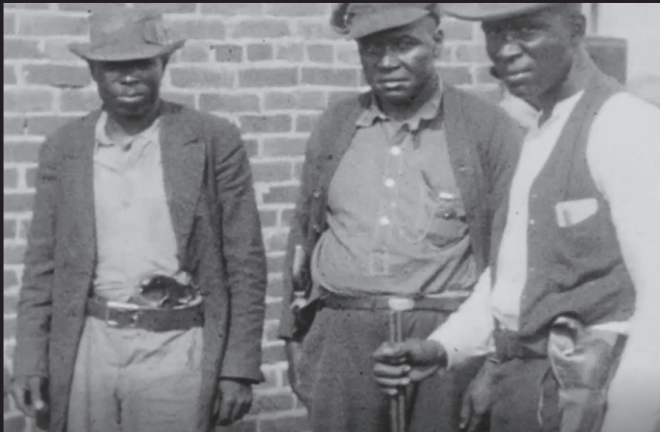
Black veterans led fierce self-defense but were badly outgunned by the mob, which included 150 cops and National Guard troops.

This year is the 100th anniversary of the Tulsa massacre in 1921, in which armed mobs of racist white people, including many police, in Tulsa, Oklahoma, slaughtered hundreds of Black people, terrorized thousands, and burned down a thriving Black community, with its churches, hospitals, homes, schools, libraries, and businesses. And this kind of murderous oppression is still going on, in many horrific ways, under the rule of this system—in this country and worldwide.