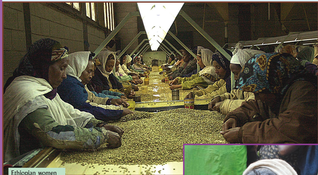
Ethiopian women sort coffee beans.

There is no reason that food must be produced and exchanged in the way it is today—other than the fact that the system of capitalism demands this, and enforces it through its armed might and political power. All this is not only criminal, but totally unnecessary. The basis exists, in human knowledge, technology, and resources, to solve the food needs of humanity.