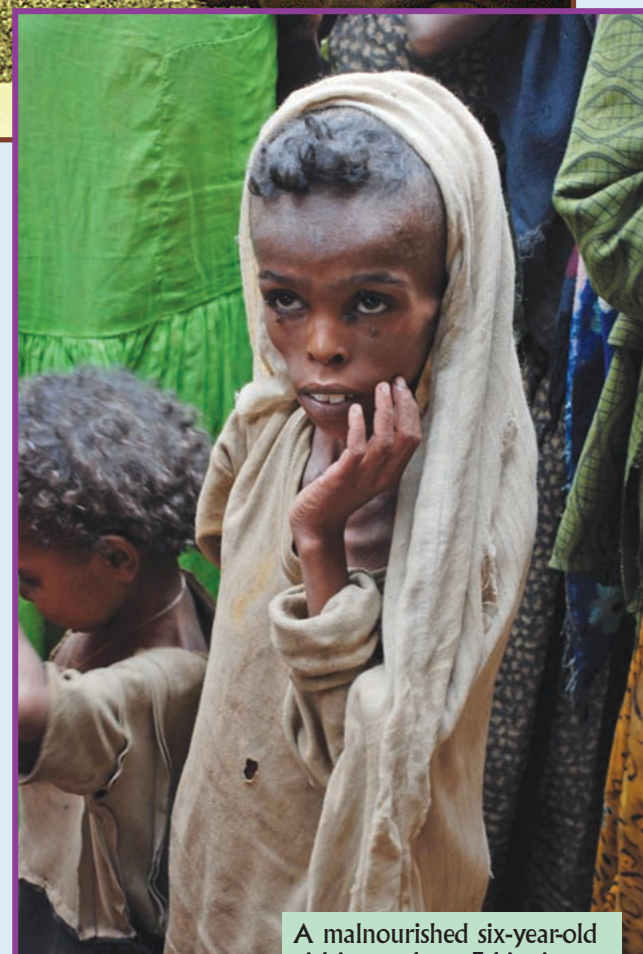
A malnourished six-year-old girl in southern Ethiopia.

The industrialization of agriculture on a world scale means that production of food in the Third World is highly vulnerable to sudden and dramatic changes in the world market. For example, many poor countries shifted into coffee production in the 1980s and 1990s to take advantage of high world coffee prices. But they wound up competing with each other and, when coffee prices plunged, some suffered dire economic consequences. In El Salvador, malnutrition is spreading because coffee growers are unable to compete in the world market and have lost income and livelihoods—and at the same time, the amount of food they get has been cut in half because of rising food prices. In Ethiopia, 4.5 million people needed emergency food aid in June 2008.