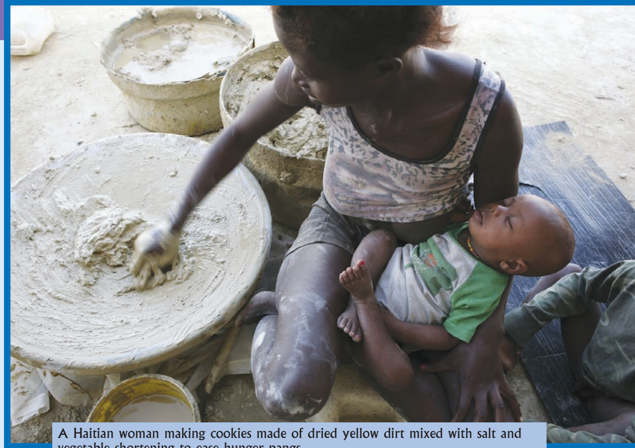
A Haitian woman making cookies made of dried yellow dirt mixed with salt and vegetable shortening to ease hunger pangs.

In Haiti, where people live on less than $2 a day and food prices have risen by 40 percent in the past year, people are forced to eat cookies made of dirt as a remedy for hunger. Here we are in the 21st century, and hundreds of millions of poor people worldwide who were already malnourished now face the threat of starvation. People in poor countries around the world are taking to the streets to demand something as basic as a loaf of bread or a bowl of rice.