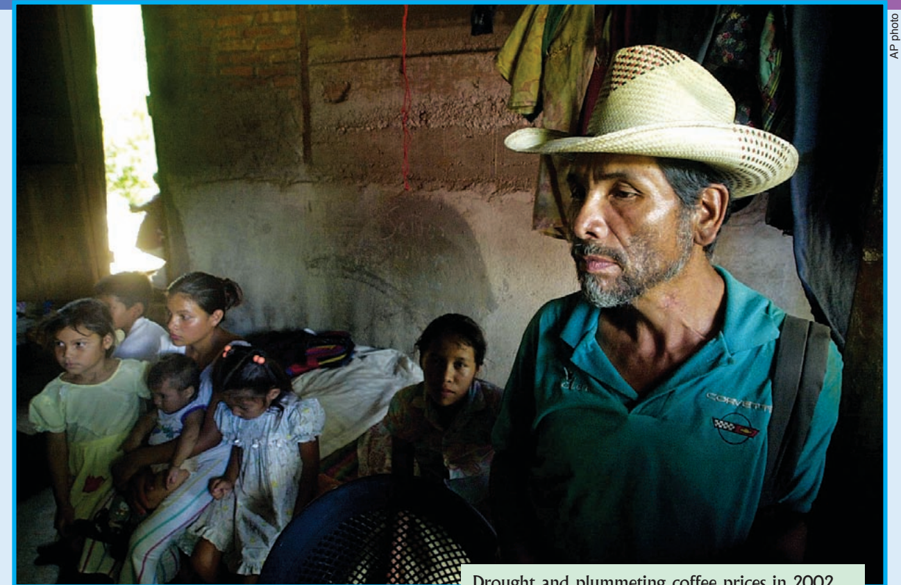
Drought and plummeting coffee prices in 2002 left farmers in El Paraiso, Nicaragua, unable to provide for their families. Thousands of people suffered from malnutrition and related diseases. Here, a family awaits medical assistance.

As a matter of conscious Western imperialist foreign policy, poor countries—some of which had been largely self sufficient in food—have been turned into food importing countries. Third World countries have been forced to shift much of their food production away from subsistence crops to high value exports. They have been pressured to open up their markets to cheap food imports. As a result, local food production for domestic consumption has been undercut. Now these countries are caught in a vise: The price of imported food has gone way up at the same time that the ability to produce food for local consumption has been eroded. And so we have the phenomenon of millions of ruined peasants and farmers, no longer able to live off the land, flooding into the slums and shantytowns of the cities.