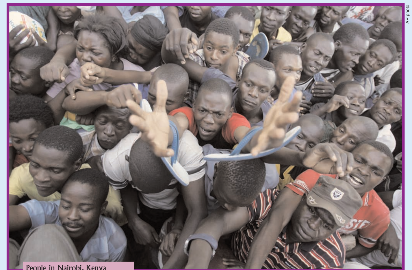
People in Nairobi, Kenya demanding food, January 2008.

A recent article in the New York Times (“Food Is Gold, So Billions Invested in Farming,” June 5, 2008) described how capitalist investors are now looking to pour huge amounts of capital into agriculture around the world—not to help ease the food crisis, but because they see an opportunity to make enormous profits. The head of a British firm said it is investing in Sub-Saharan Africa because “land values are very, very inexpensive.... Its microclimates are enticing, allowing a range of different crops. There’s accessible labor. And there’s good logistics—wide open roads, good truck transport, sea transport.”