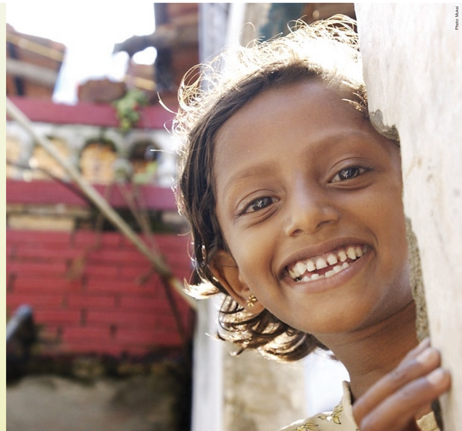
Sri Lanka after the 2004 tsunami

*“A Declaration: For Women’s Liberation and the Emancipation of All Humanity,” a special issue of Revolution newspaper available at revcom.us.