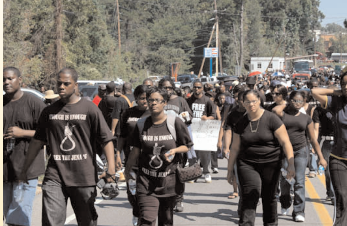
Jena, Louisiana, September 20.

The battle to Free the Jena 6—six Black high school youths persecuted for resisting racism—is shining a light on the reality of oppression today for Black people in America: On September 20, tens of thousands of people came from across the country to Jena, Louisiana to demand that the Jena 6 be freed. Nothing like this mobilization—has been seen in a long, long time. The battle to free these youth must continue and grow.