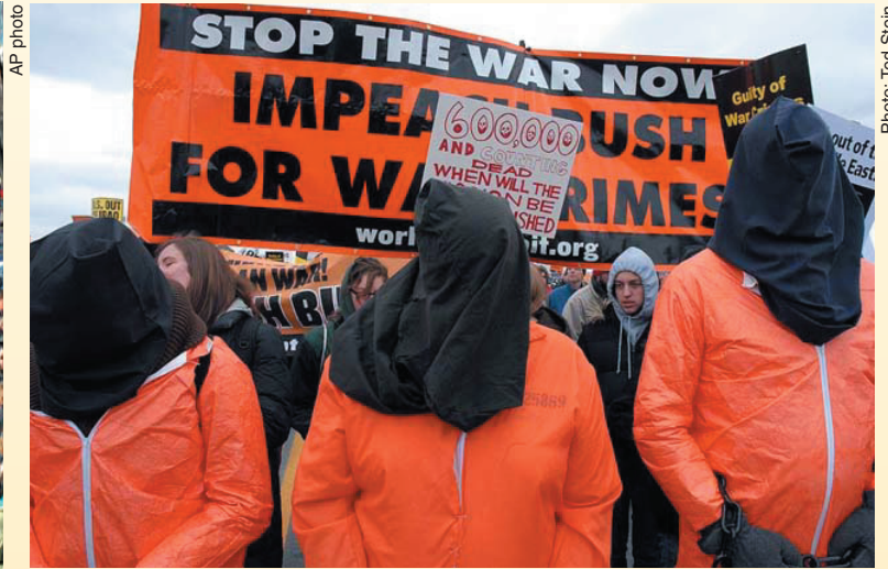
Washington, DC, January 11