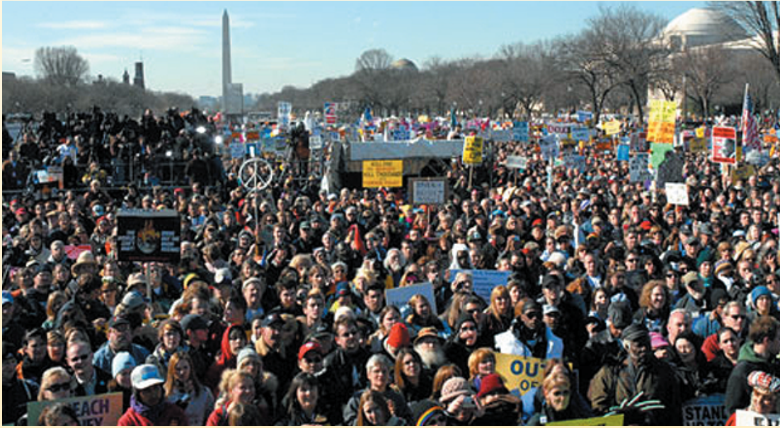
Washington, DC, January 27.