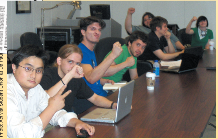
June 11, Students sit-in at De Paul University.