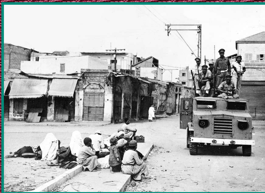
Palestinian residents watch Israeli occupation forces entering the town of Majdal, November 1948.

5 One infamous massacre took place in April 1948 at Deir Yassin, west of Jerusalem, where 250 people were murdered. Israeli historian Ilan Pappé (author of the book The Ethnic Cleansing of Palestine ) describes how Jewish soldiers burst into the village and sprayed the houses with machine-gun fire, killing many instantly: "The remaining villagers were then gathered in one place and murdered in cold-blood, their bodies abused while a number of women were raped and killed."