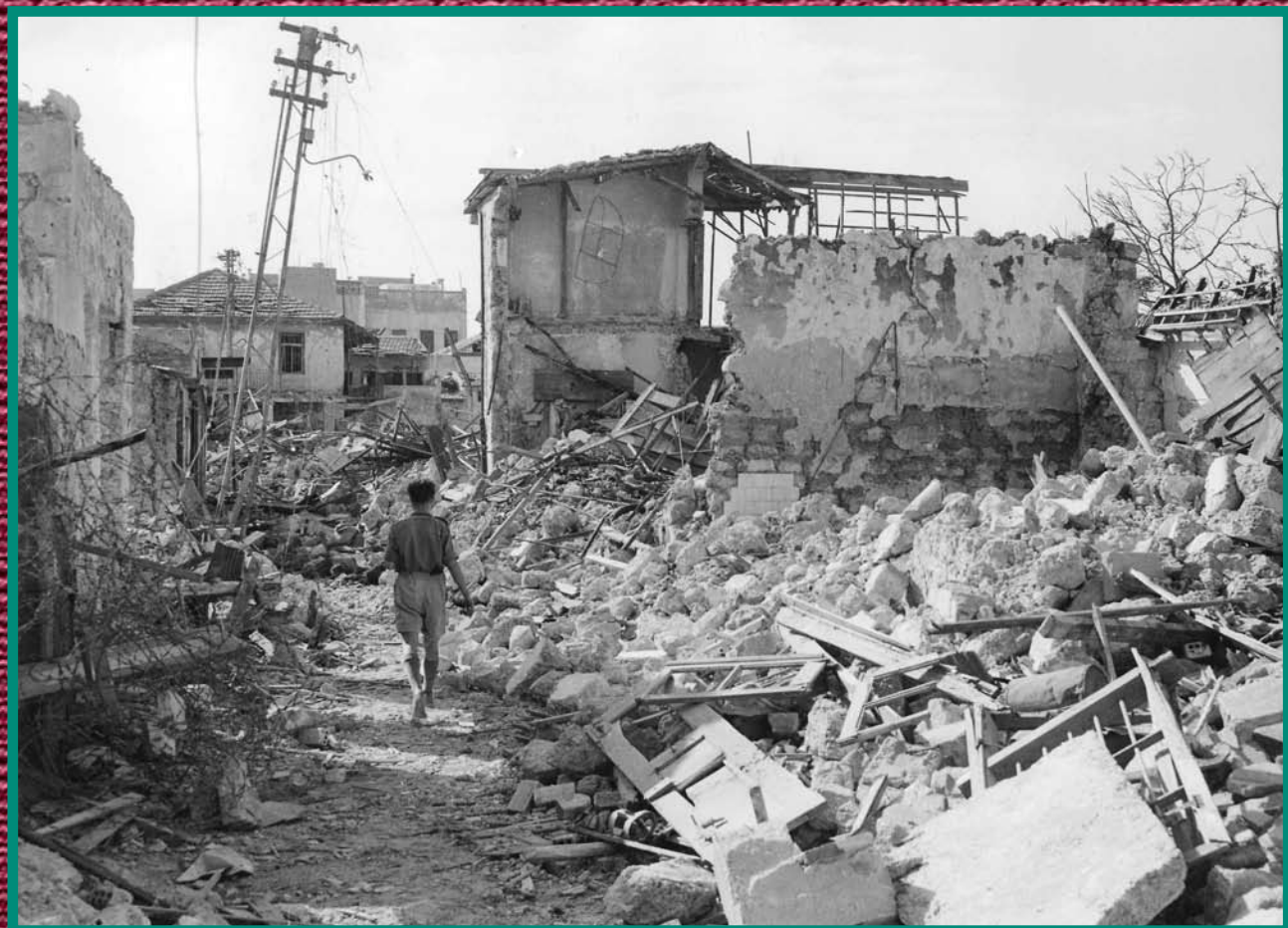
The Manshiah quarter in Jaffa, home to Palestinians, after it was destroyed by Irgun Jewish forces, May 1948.

1 How many times have you had a discussion about the plight of the Palestinians with supporters of the state of Israel and met the argument that the problem is the Palestinian "intolerance" of Jewish settlers? People have been taught that Israel was established as the result of a heroic fight for their homeland up against an "inhuman" enemy. But the reality is far different.