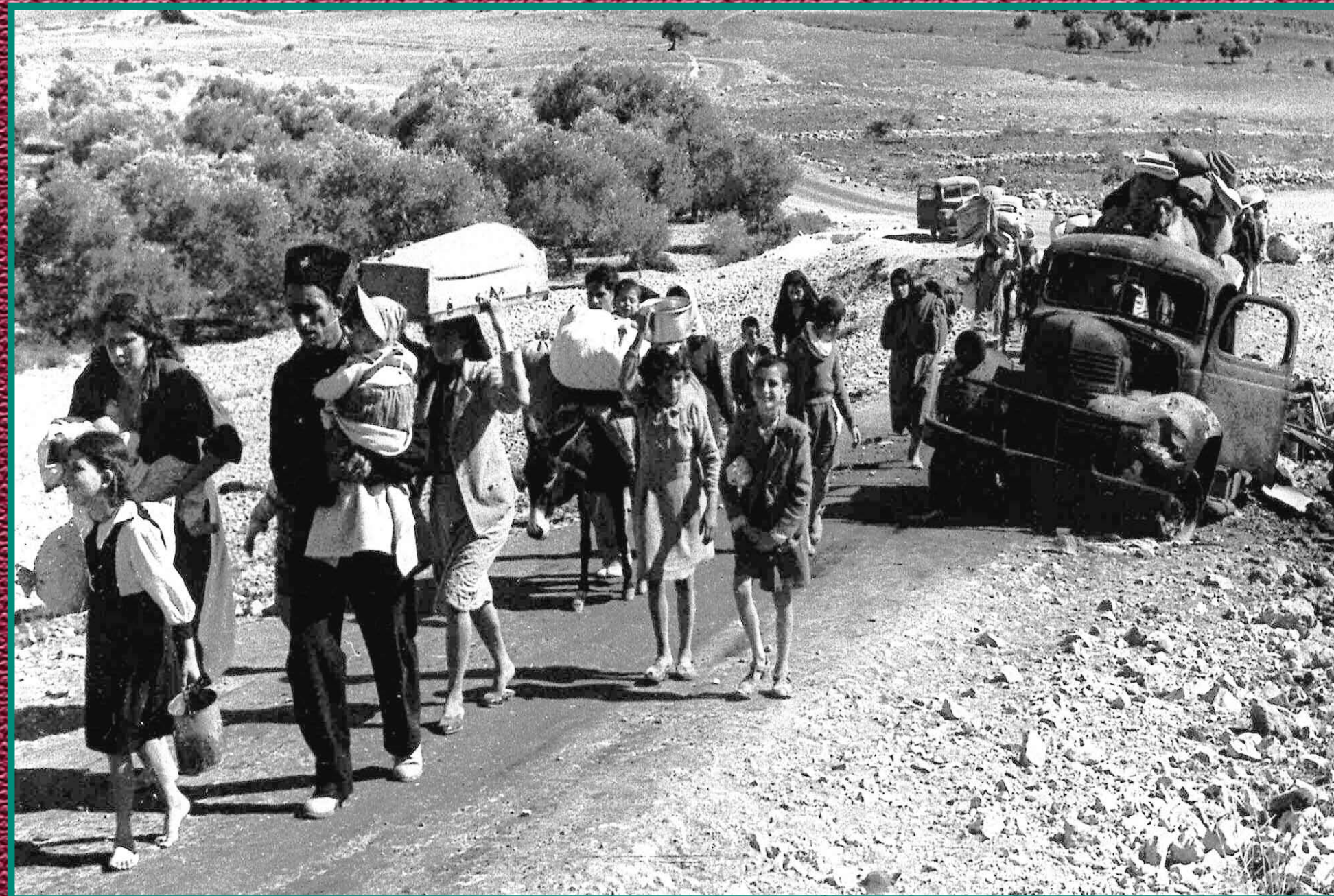
Palestinians driven from their homes in Galilee are on the road to Lebanon, November 1948.

2 In the early 1900s most of the world's Jews lived in Europe, where they were bitterly oppressed and often very active in revolutionary and progressive movements. The Zionist movement arose in opposition to that. One of its founders, Herzl, said: "For Europe we shall create there in Palestine an outpost against Asia, we shall be the vanguard of the civilized world against barbarism."