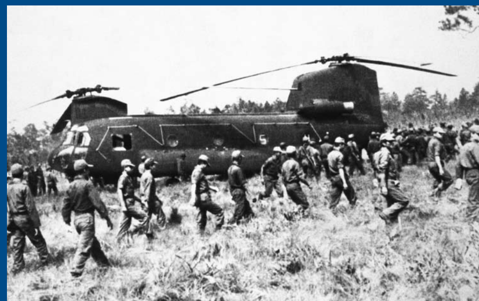
Honduran soldiers in a joint military exercise with the U.S. Air Force in 1982 along the Nicaraguan border near Puerto Lempira.