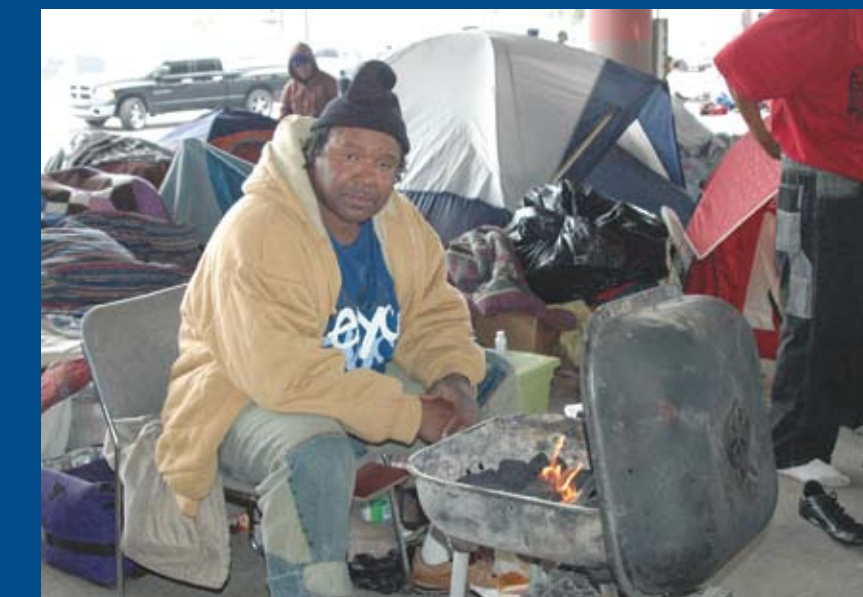
New Orleans, 2008: Homeless encampment under the freeway.