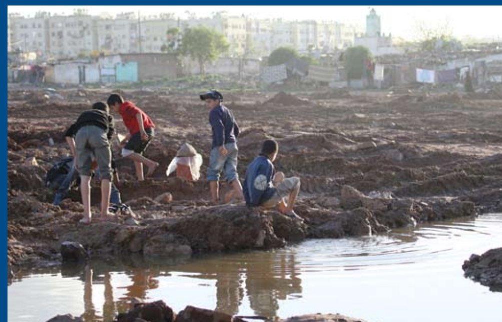
Children playing in the Sidi Moumen slum of Casablanca, Morocco, 2009.

Poor countries in Asia, Africa, and Latin America have been subjected to Structural Adjustment Programs (SAPs) imposed by the International Monetary Fund (IMF) and the World Bank. SAPs require that Third World governments must meet strict conditions to get new loans or to obtain lower interest rates on existing loans. Both the IMF and World Bank are controlled by the imperialist powers, especially the United States. And this restructuring creates more favorable conditions for imperialist trade and investment. SAPs have forced Third World governments to open up markets, land, and other resources to imperialist agribusiness, including food exporters. And they have hurt the mass of peasant producers. They force governments to cut subsidies to small farmers and support programs in rural areas, and to emphasize high-value export agriculture (like asparagus or exotic flowers). This, too, draws resources away from traditional and subsistence agriculture. The agricultural economy of whole countries becomes dictated by the needs of imperialism—not by what the people need to survive. All this has led to millions of peasants around the world being driven off their land, into urban shantytowns and across borders into other countries where they face intense repression.