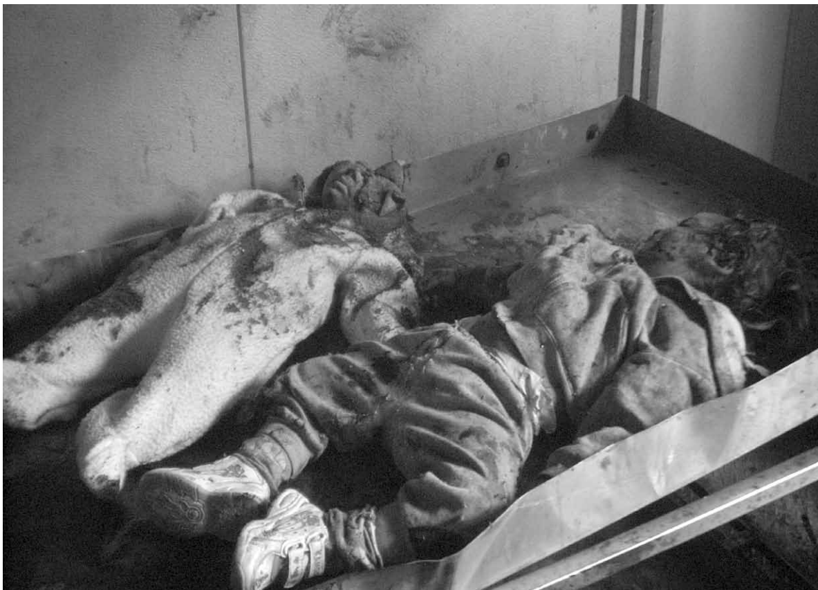
Above: Bodies of two children killed when U.S. troops opened fire on family's vehicle returning from a relative's funeral, Baquoba, Iraq, 2005.

Left: A Vietnamese father holds his child, covered in burns from a U.S. napalm attack, 1964.