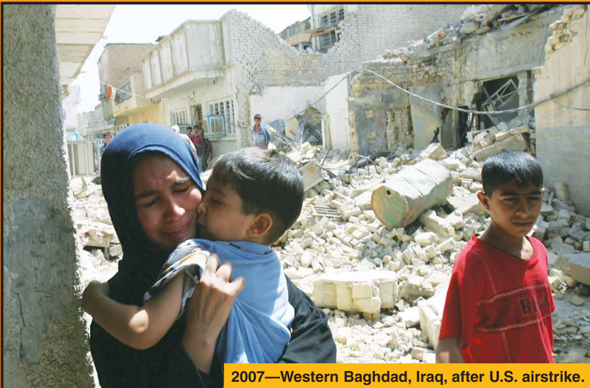
2007—Western Baghdad, Iraq, after U.S. airstrike.