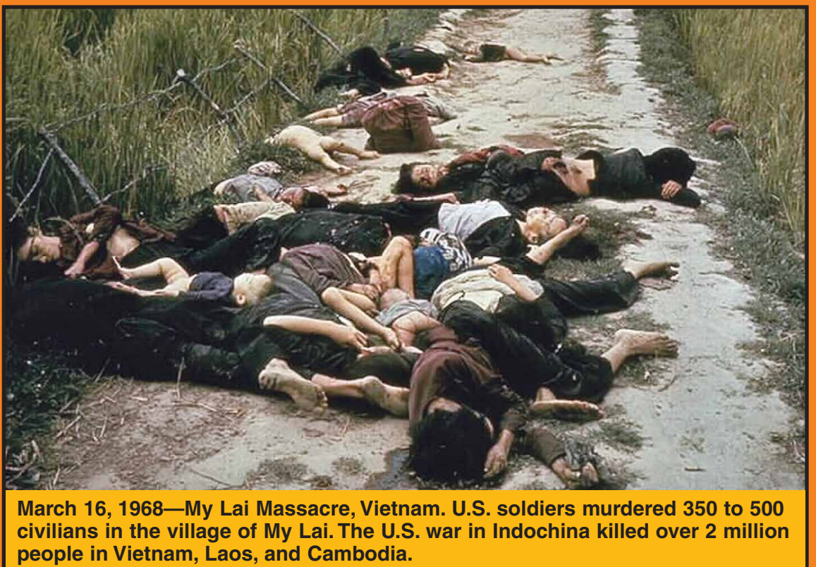
March 16, 1968—My Lai Massacre, Vietnam. U.S. soldiers murdered 350 to 500 civilians in the village of My Lai. The U.S. war in Indochina killed over 2 million people in Vietnam, Laos, and Cambodia.