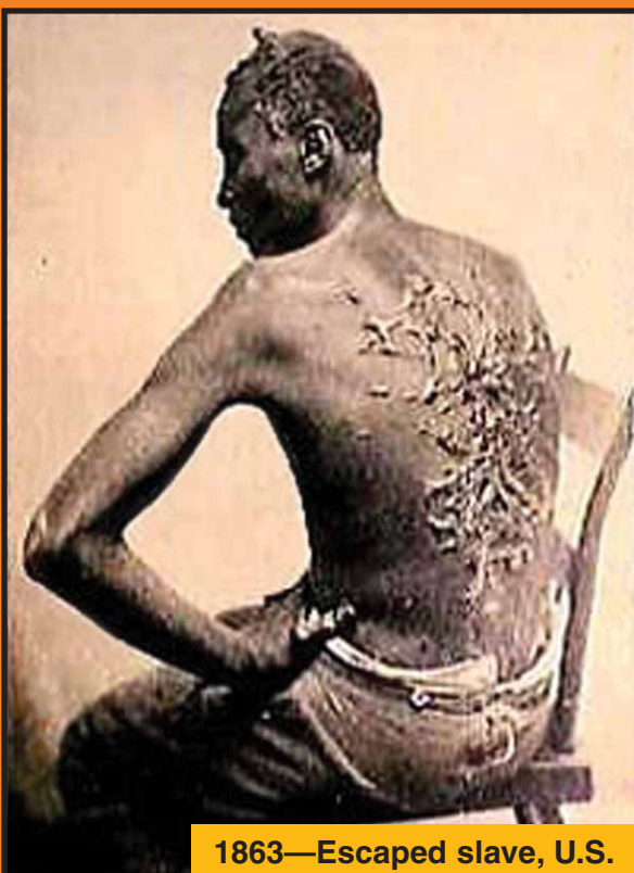
1863—Escaped slave, U.S.