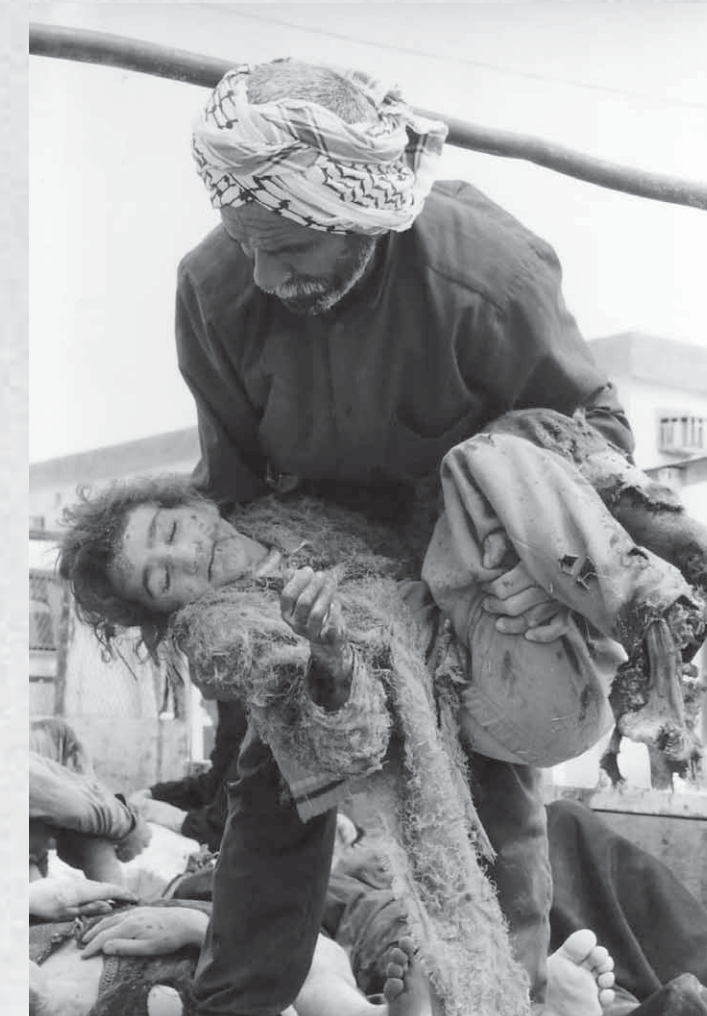
2003, Iraq: Young girl wounded after U.S. air strikes over the city of Basra.