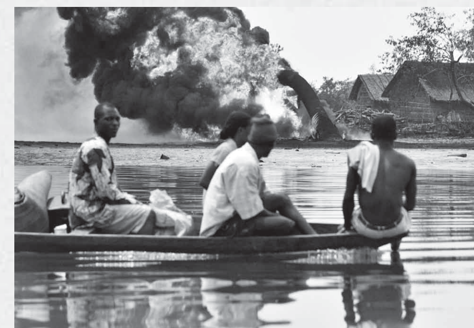
2005, Nigeria: People evacuate their homes because of a burning oil pipeline belonging to the Shell Petroleum Development Company.