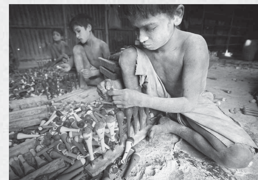
2009, Bangladesh: Child laborers work at a balloon workshop.