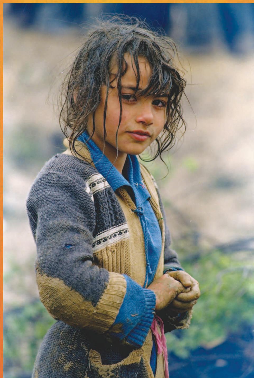
A young Kurdish refugee girl at a refugee camp on the Iraqi border, 1991.