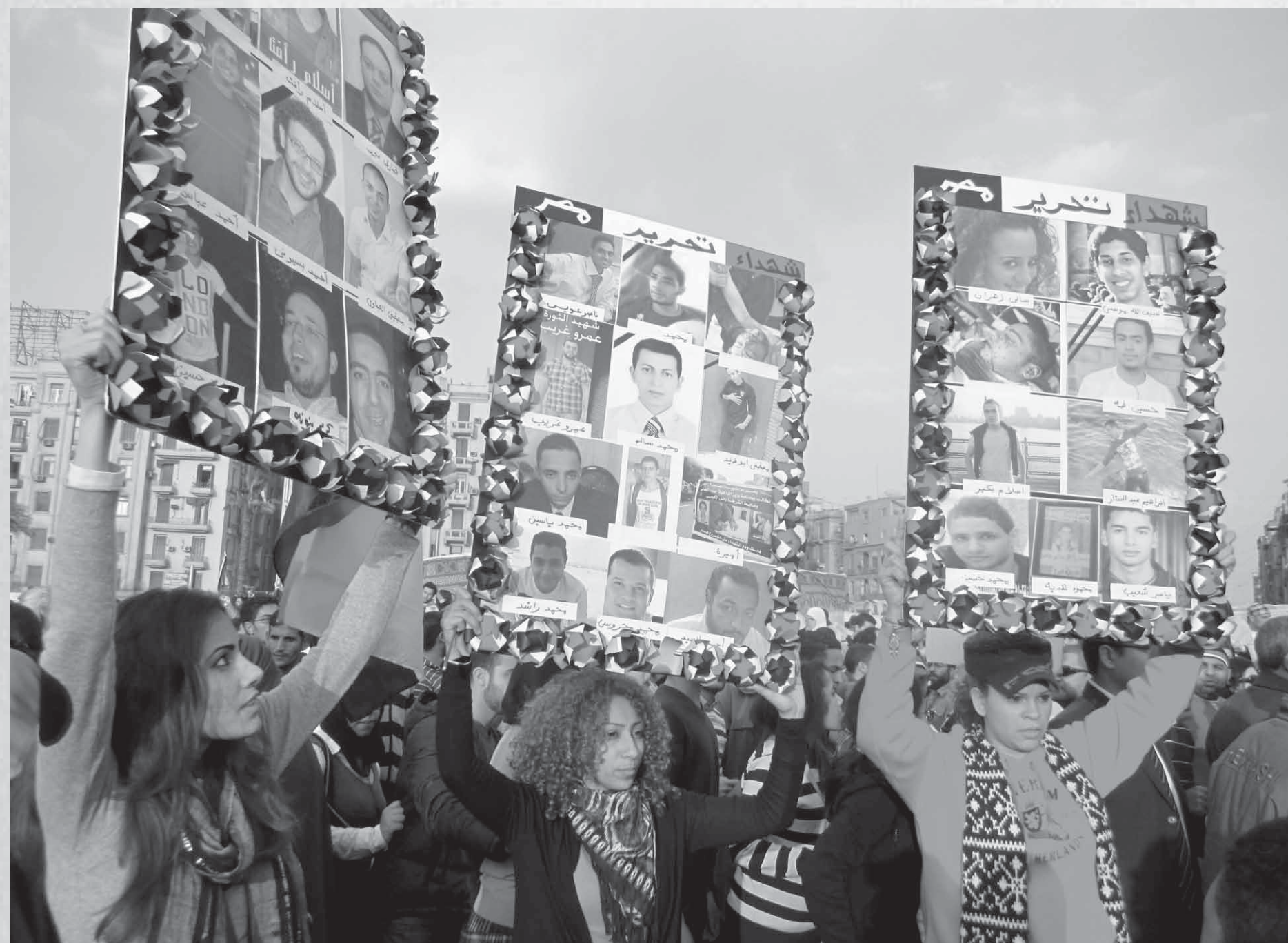
Cairo, February 8, 2011: Protestors carrying posters showing men and women killed by state security.

Read the entire statement online in English, Arabic, Spanish and other languages at revcom.us .