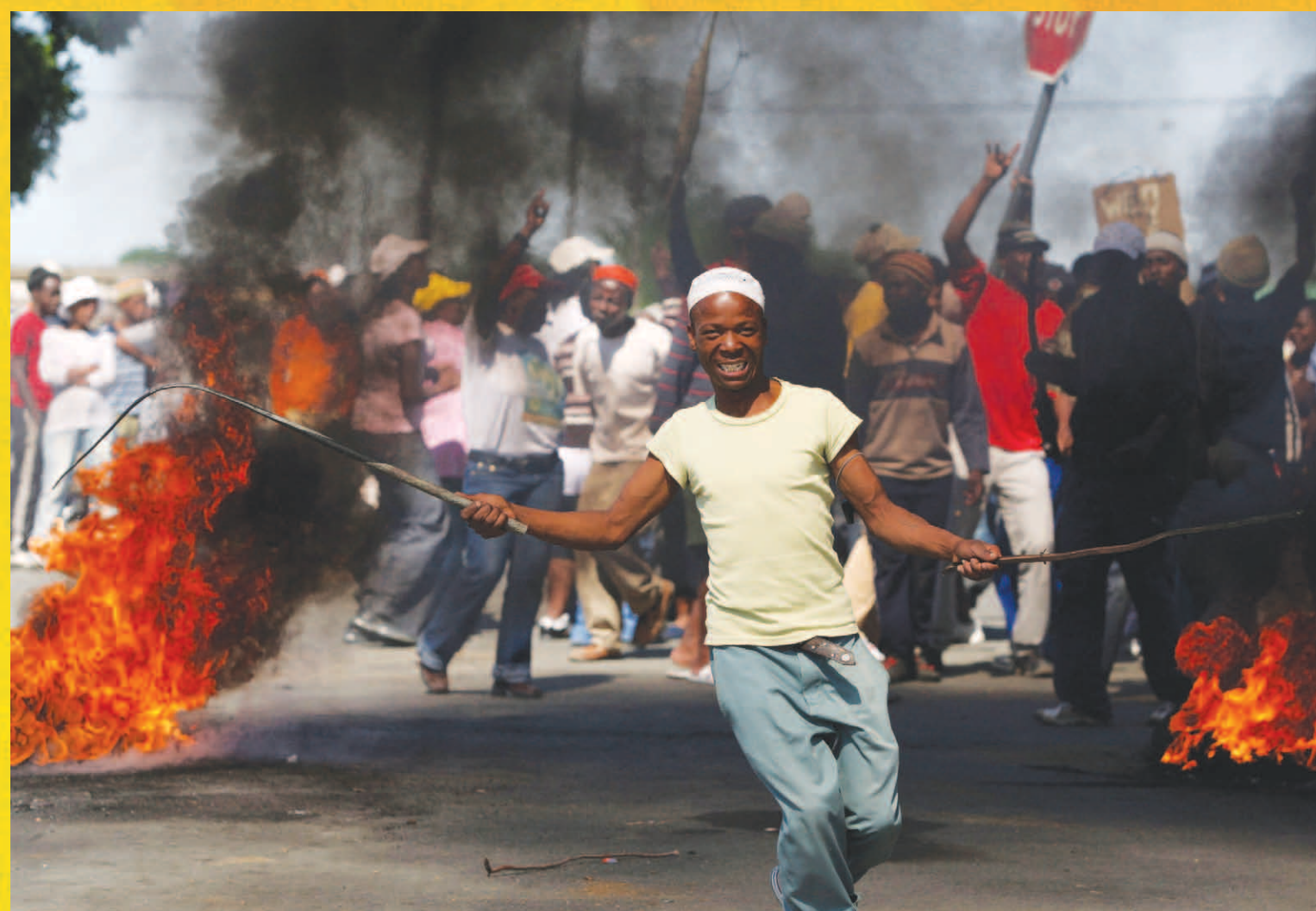
South Africa: Protest in Sakhile Township against poor living conditions, 2009.

No more generations of our youth, here and all around the world, whose life is over, whose fate has been sealed, who have been condemned to an early death or a life of misery and brutality, whom the system has destined for oppression and oblivion even before they are born. I say no more of that.