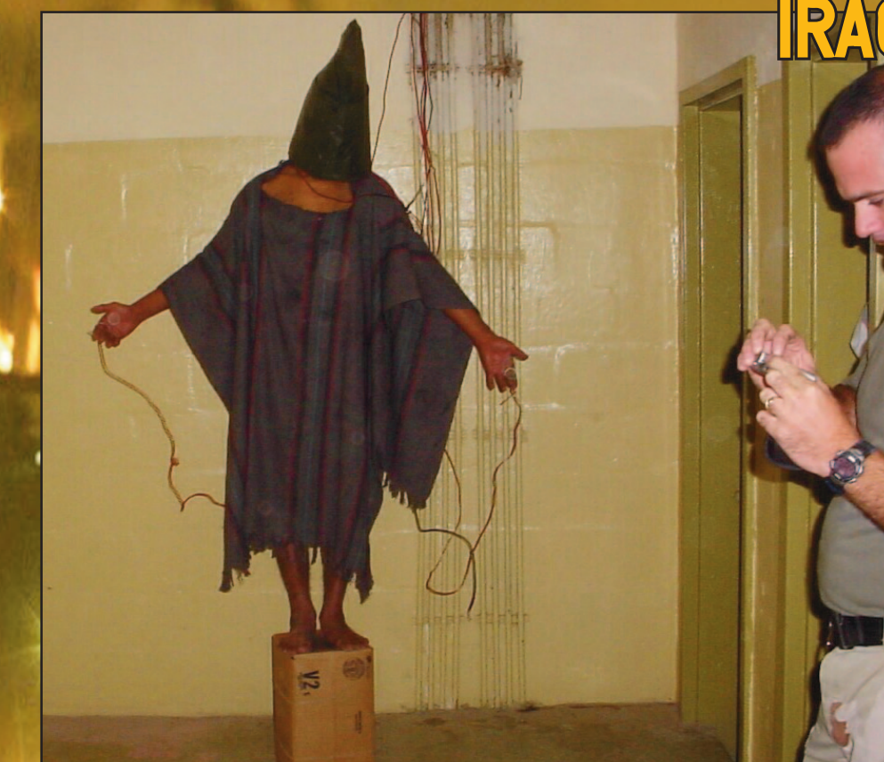
Abu Ghraib Prison, Iraq, 2003-4. Leaked photos exposed the torture and murder of Iraqi prisoners by U.S. soldiers.