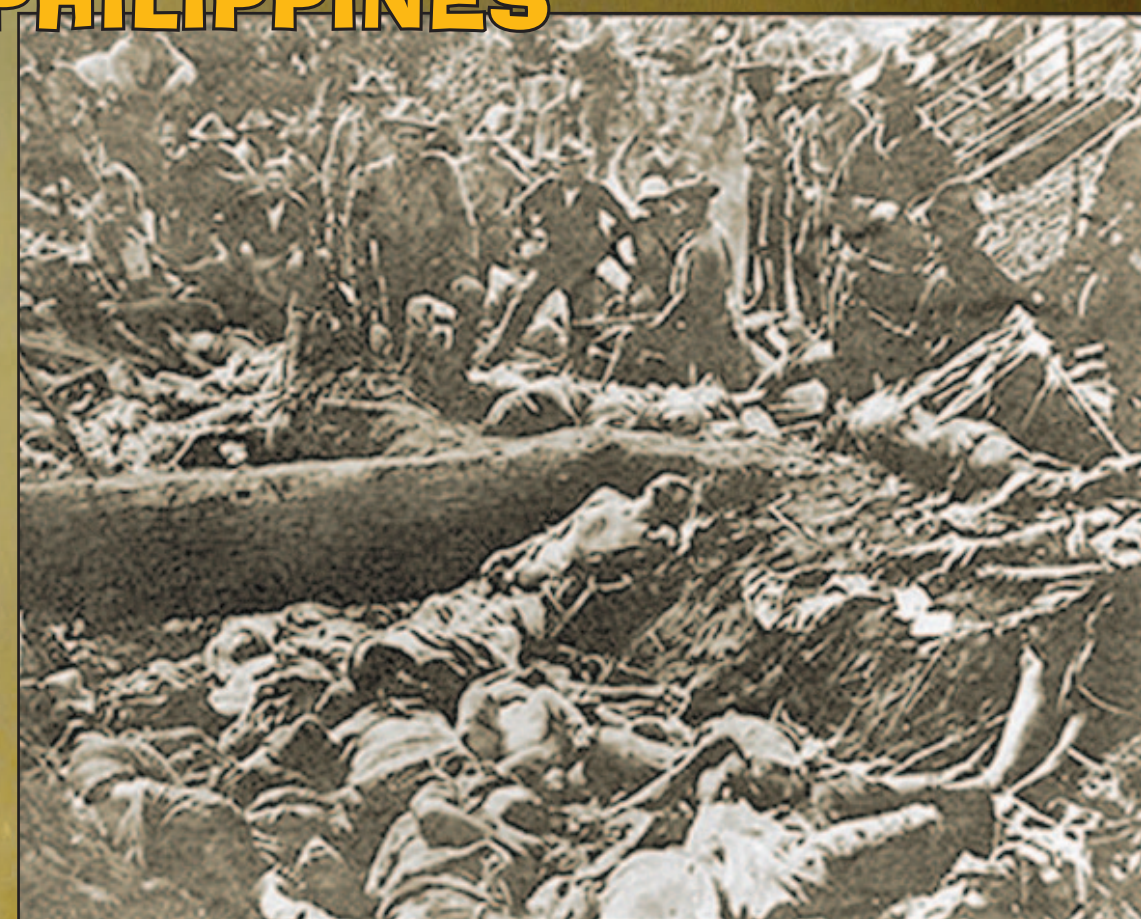
Jolo, Philippines, 1906. Some of the hundreds of Moro rebels slaughtered by the U.S. Army.