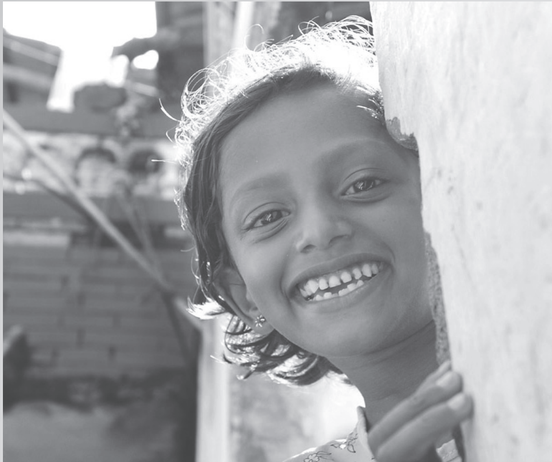
Sri Lanka, 2004

Look at all these beautiful children who are female in the world. And in addition to all the other outrages which I have referred to, in terms of children throughout the slums and shantytowns of the Third World, in addition to all the horrors that will be heaped on them—the actual living in garbage and human waste in the hundreds of millions as their fate, laid out before them, yes, even before they are born—there is, on top of this, for those children who are born female, the horror of everything that this will bring simply because they are female in a world of male domination. And this is true not only in the Third World. In