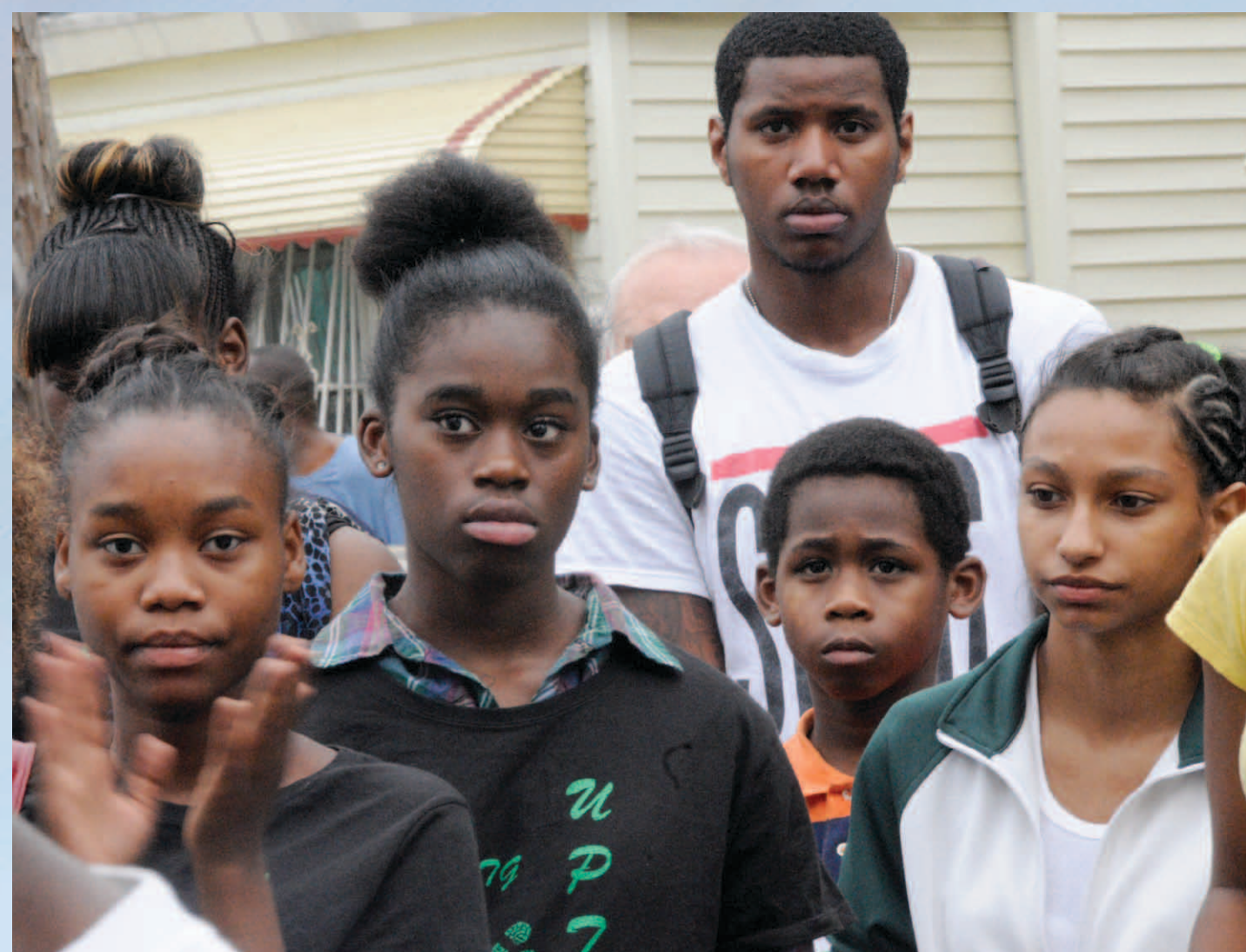
Bronx, New York, 2012. At a rally for justice for Ramarley Graham.

There is nothing more unrealistic than the idea of reforming this system into something that would come anywhere near being in the interests of the great majority of people and ultimately of humanity as a whole.