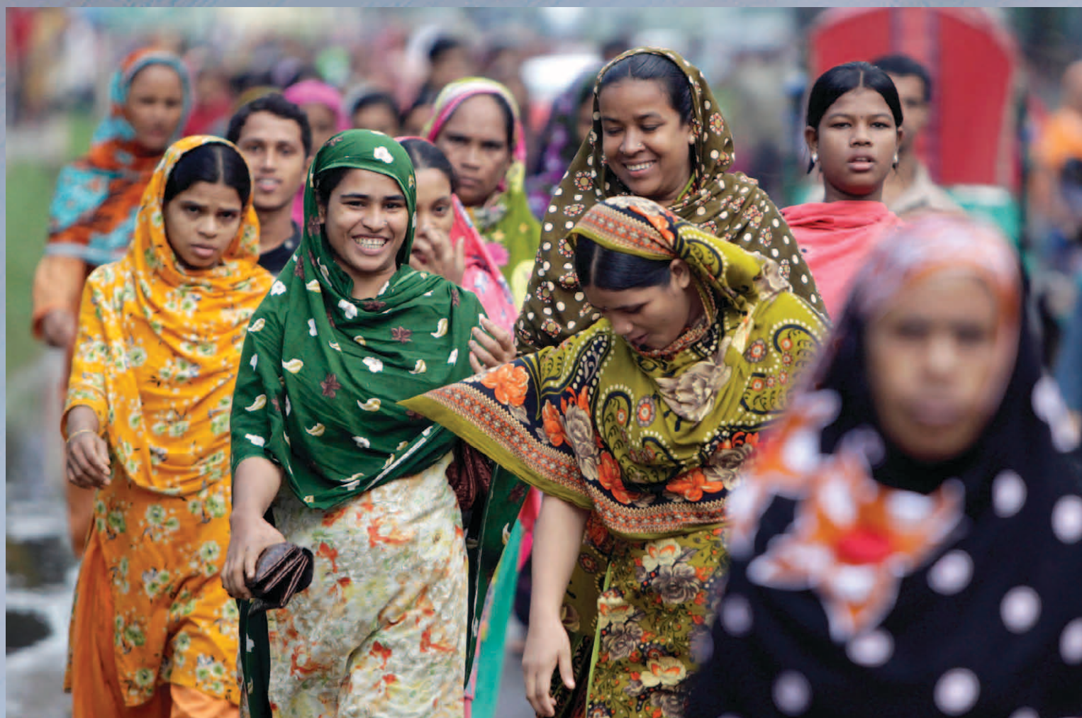
Dhaka, Bangladesh, September 2012. Women coming to work in the garment factories like the one that collapsed in 2013.