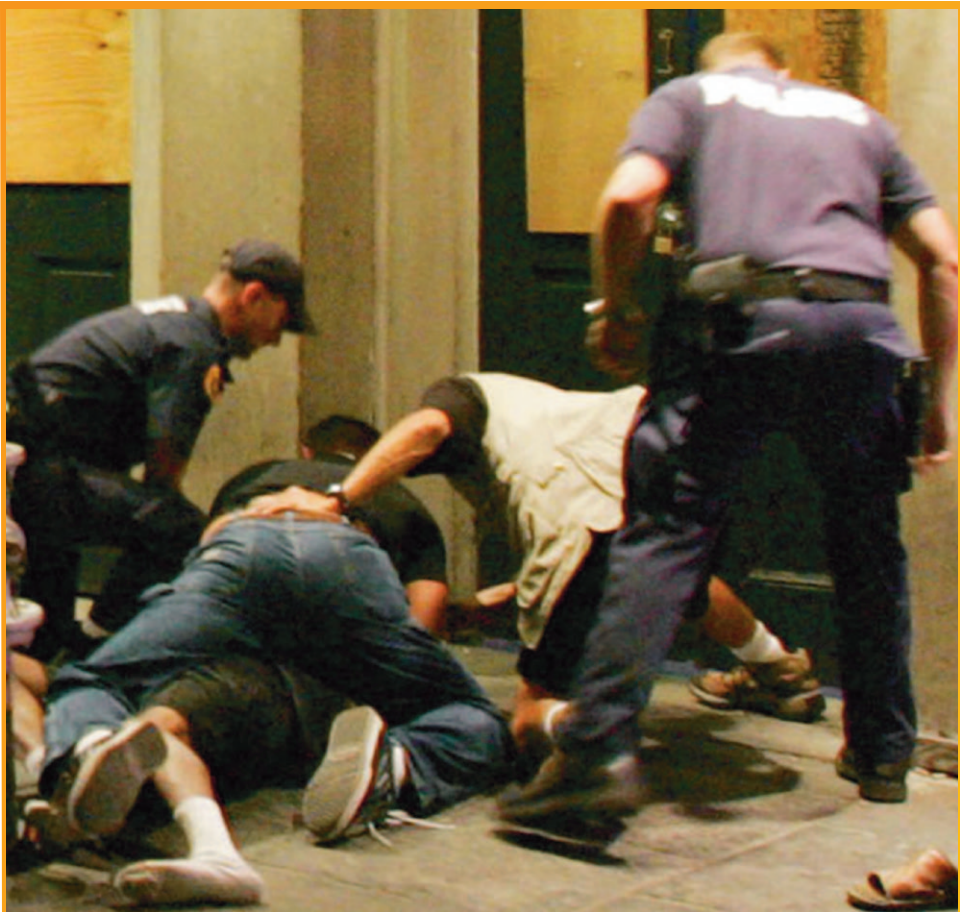
New Orleans, Louisiana, 2005, police beat a 64-year-old man.