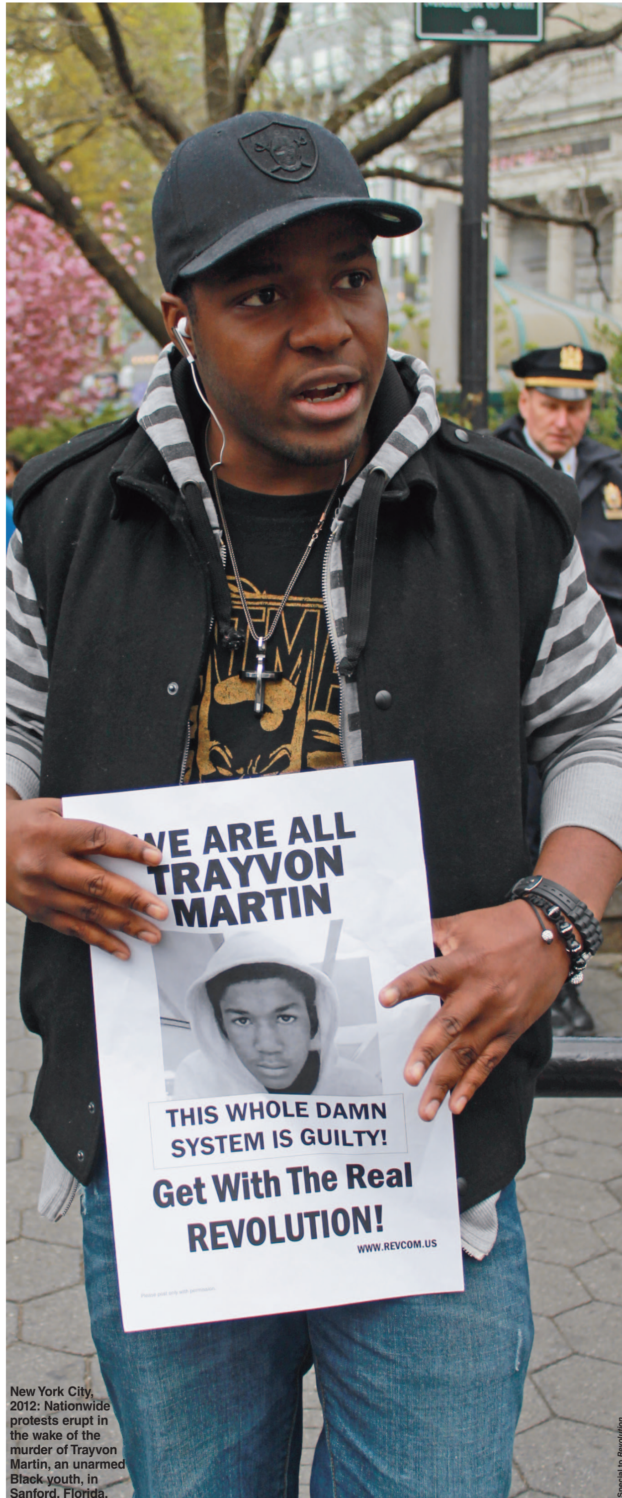
New York City, 2012: Nationwide protests erupt in the wake of the murder of Trayvon Martin, an unarmed Black youth, in Sanford, Florida.