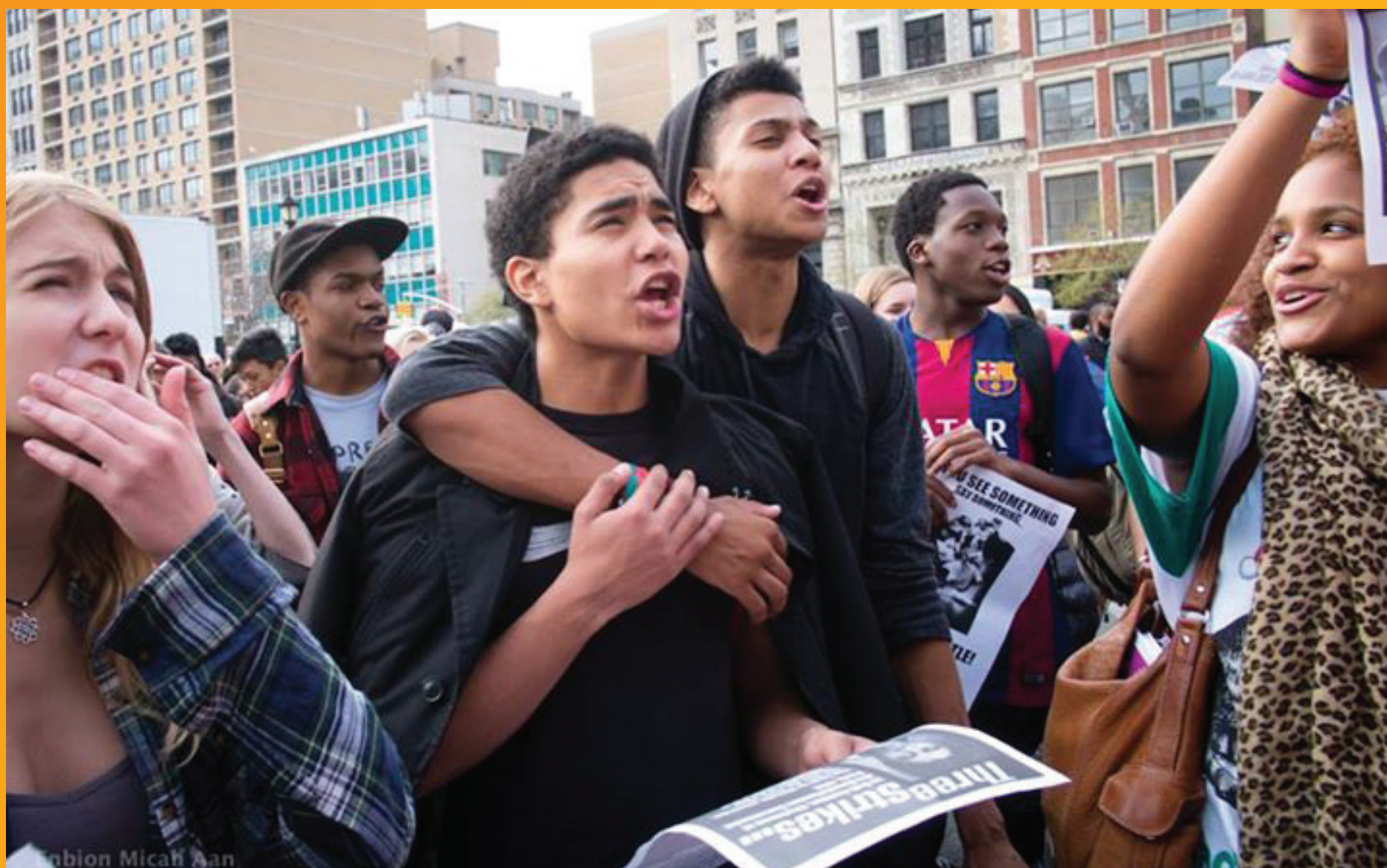
New York, December 1, 2014, after a grand jury refused to indict Ferguson, Missouri cop Darren Wilson for murdering Michael Brown.

No more generations of our youth, here and all around the world, whose life is over, whose fate has been sealed, who have been condemned to an early death or a life of misery and brutality, whom the system has destined for oppression and oblivion even before they are born. I say no more of that.