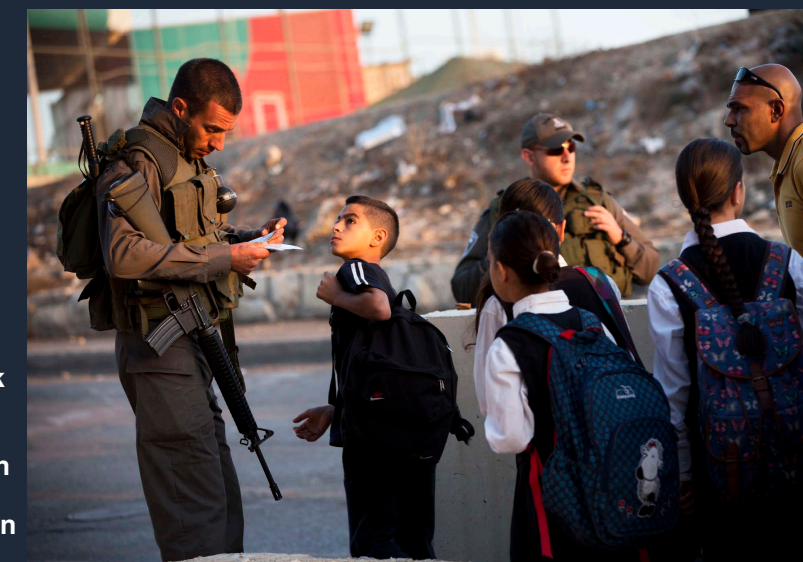
2015, Israeli border police check Palestinian children's identification at a checkpoint in Jerusalem.