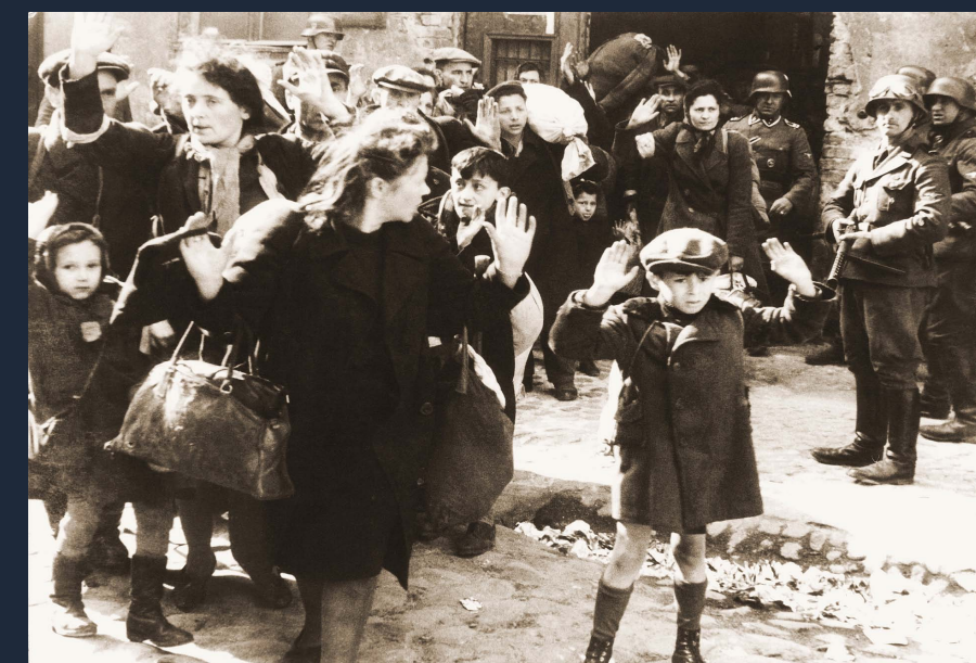
1943, German troops round up Jews after the uprising in the ghettos of Warsaw, Poland.