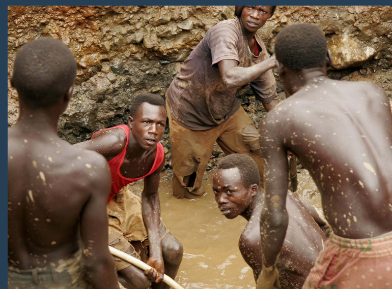
2006, gold miners at Ika Barrier, Democratic Republic of Congo.