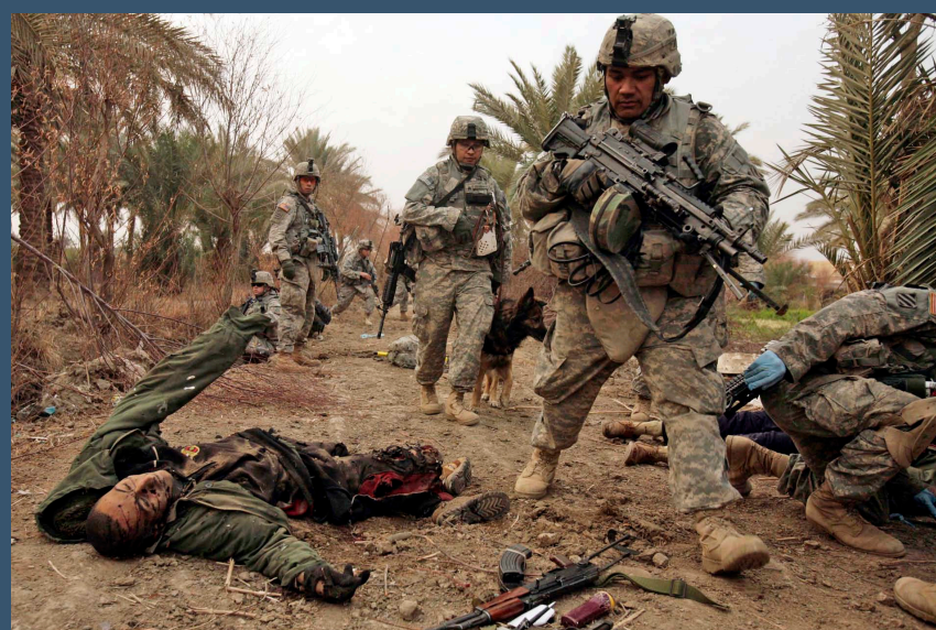
2008, U.S. troops pass the body of a person killed by an attack helicopter in Arab Jabour south of Baghdad, Iraq.