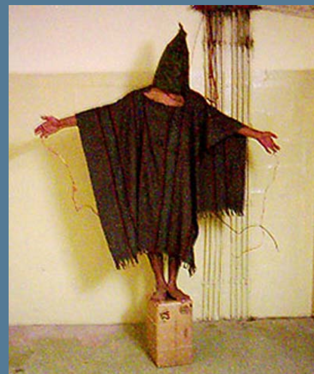
2003, the CIA and U.S. troops in Iraq torture prisoners at Abu Ghraib.