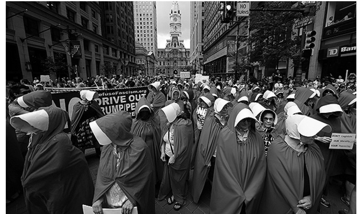
Handmaid's Tale protest against Vice President Mike Pence, Philadelphia, July 24, 2019.

Also in November, the Trump administration proposed a new rule that would allow faith-based foster care and adoption agencies (which are often the only such agencies) to continue to receive federal funds even if they discriminate against LGBTQ people.