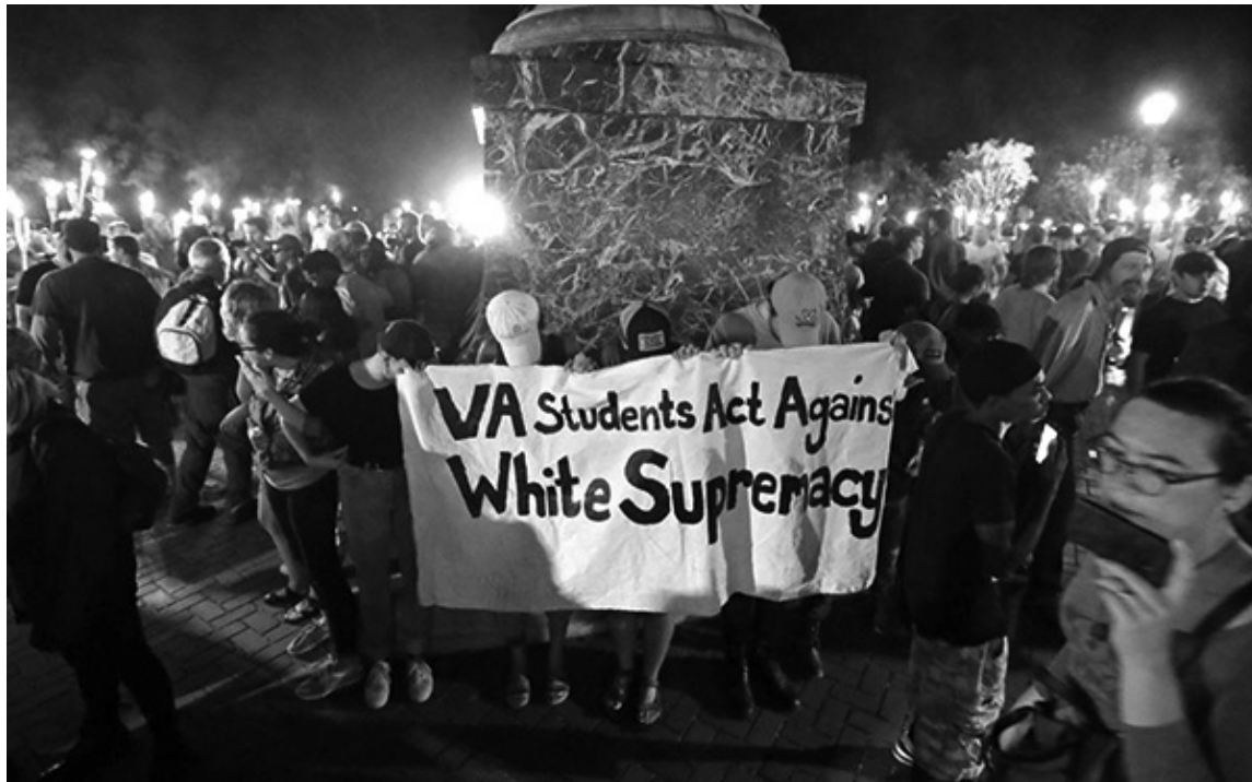
Brave University of Virginia students stand up to the fascist mob in Charlottesville, VA, July 11, 2017.

Pat Buchanan (former speechwriter for Richard Nixon and Ronald Reagan and a leading theoretician of American fascism) wrote that Putin was “entering a claim that Moscow is the Godly City of today,” and “In the culture war for the future of mankind, Putin is planting Russia’s flag firmly on the side of Christianity.”