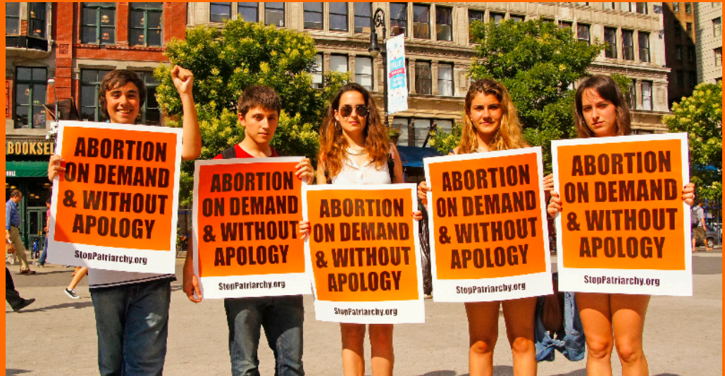
Above: New York City, at the Abortion Rights Freedom Ride send-off rally.

“What we learned here, and through the rest of our experiences in Wichita and in other places along this