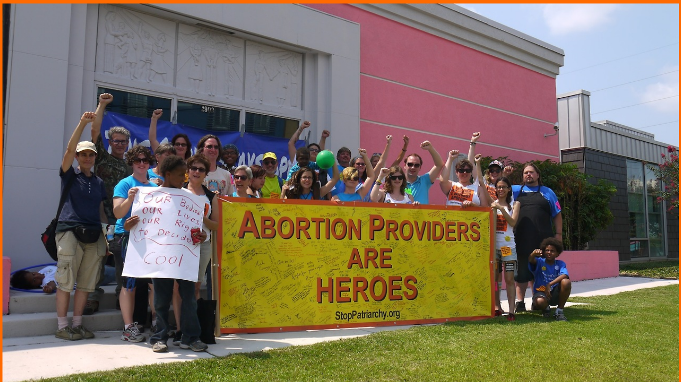
Above: A rally in front of the clinic in Jackson—last remaining clinic providing abortions to women in all of Mississippi.