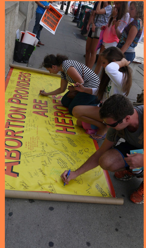
Above: Minneapolis, August 1.