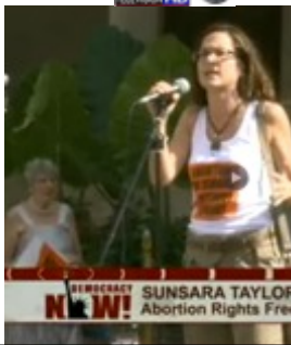
Abortion Rights Freedom Ride draws local support