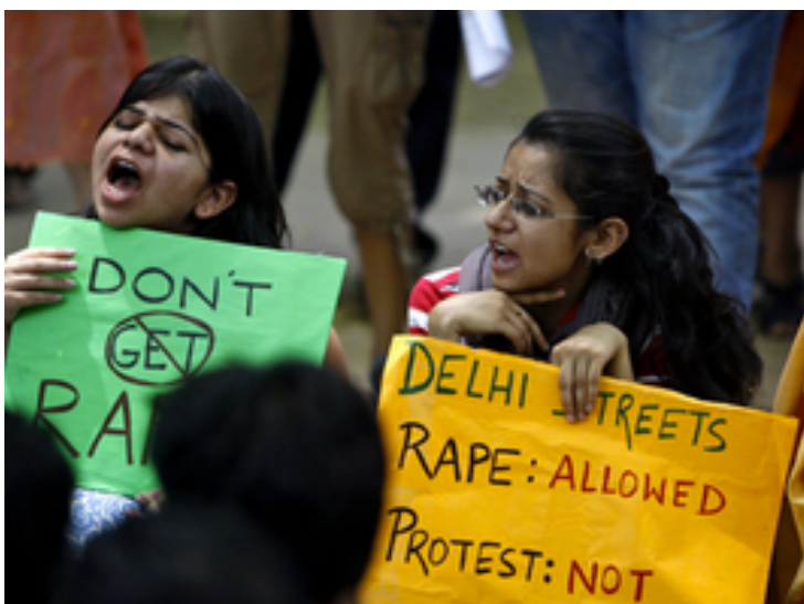
Left: Protest against gang rape in New Delhi, India, December 2012.

To learn more about why fetuses are NOT babies, see: “ What Is an Abortion and Why Women Must Have the Right to Choose ” and “ A Fetus Is Not a Baby! Abortion on Demand and Without Apology ” on revcom.us . To get further into the revolution that is needed to liberate women and emancipate all humanity, see A Declaration: For Women’s Liberation and the Emancipation of All Humanity , also on revcom.us .