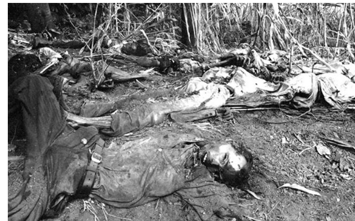
Massacre by U.S.-backed Salvadoran military in El Mozote, December 1981.

Carter (D), Reagan (R), George H.W. Bush (R)