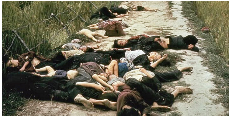
Villagers in My Lai, Vietnam, massacred by U.S. troops, March 16, 1968.

Eisenhower (R), John Kennedy (D), Lyndon B. Johnson (D), Richard Nixon (R), Gerald Ford (R)