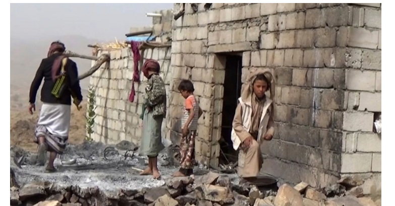
U.S.-backed Saudi Arabia airstrike on Yemen, 2015.

In March 2015, Saudi Arabia, with U.S. backing, launched a war against Yemen's Houthi movement. Since then, over 150,000 people have been killed. The Saudis have bombed Yemen's food, water, and medical systems, causing massive hunger and disease. As many as 400,000 children have starved to death as a result.