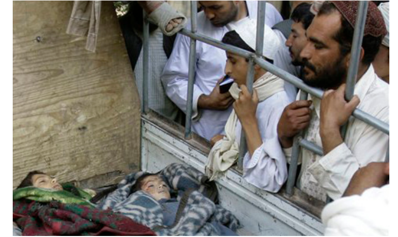
Children killed in U.S. air war in Afghanistan, 2009.

George W. Bush (R), Obama (D), Trump (R), Biden (D)